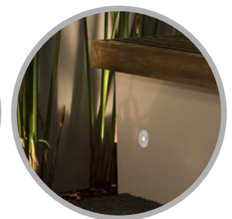
Recessed Wall Mounting