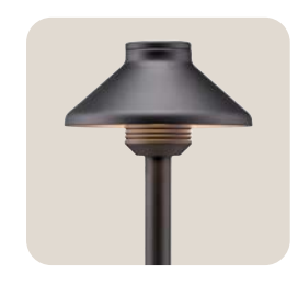
Vantage DL-A Path Light