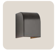
Modern™ QL Wall Sconce