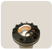
Terra™ FC In-Grade (Louvers, Ring, Cowling)