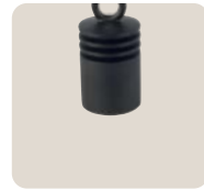
Runa™ LE Hanging Pendant