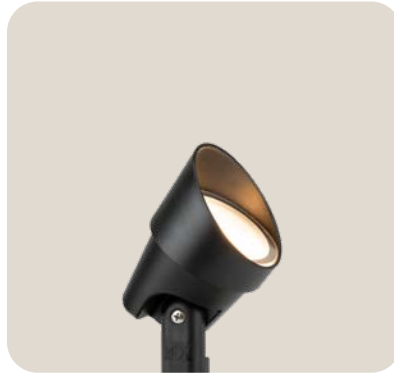
Evo EW-31 Petite Wall Wash