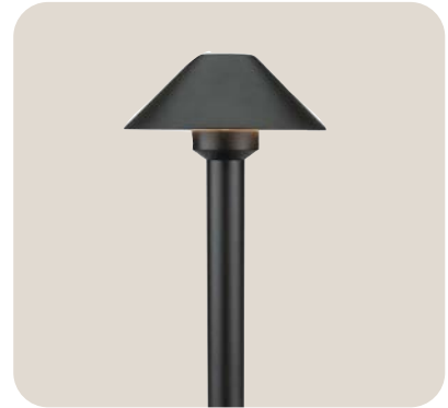
Evo EP-31 Petite Path Light