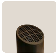
Terra™ CF Well Light (Grid, Grate)