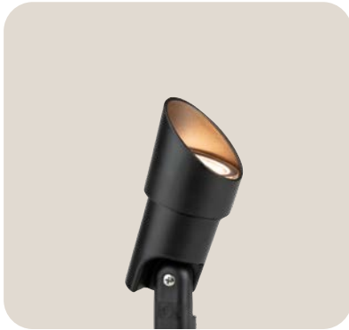
Evo EA-51 Accent Light