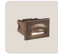
Garden™ UN Recessed Wall Light